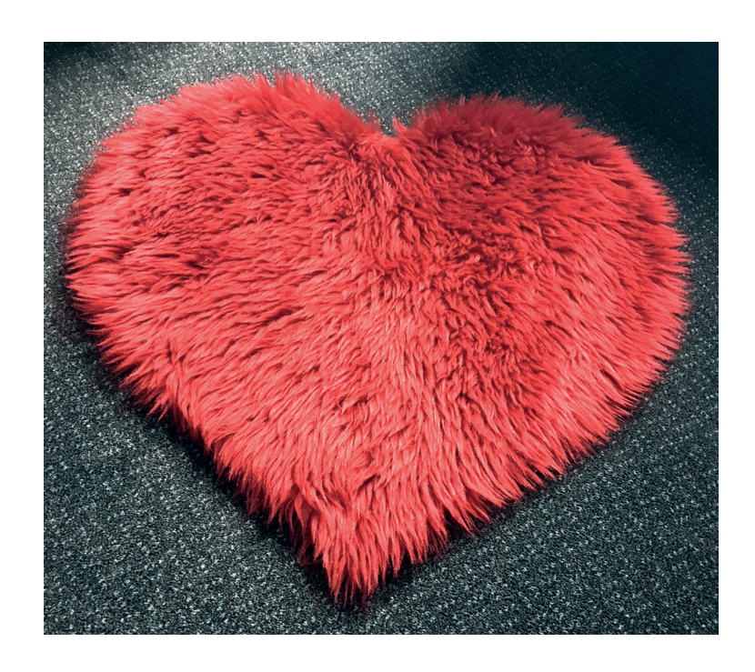
Picture yourself standing on a place of the Father's love for YOU, his heart for you.